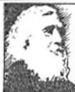
Freeland | Hayek

FREELAND Press, Box 26044, Santa Ana, CA 92799