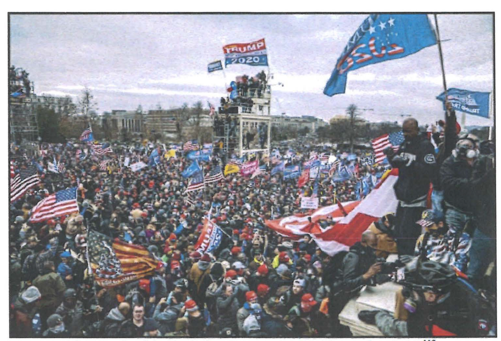
Photograph of the Capitol on January 6, 2021 <sup>113</sup>