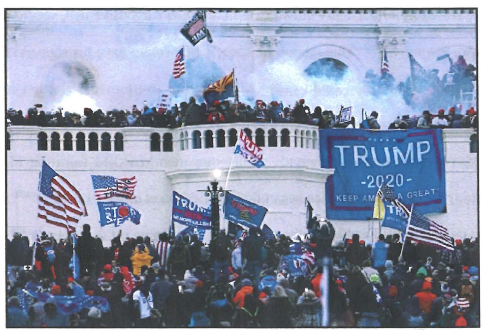
Photograph of the Capitol on January 6, 2021 112