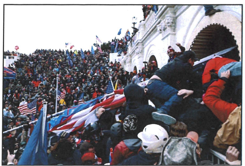
Photograph of the Capitol on January 6, 2021 114