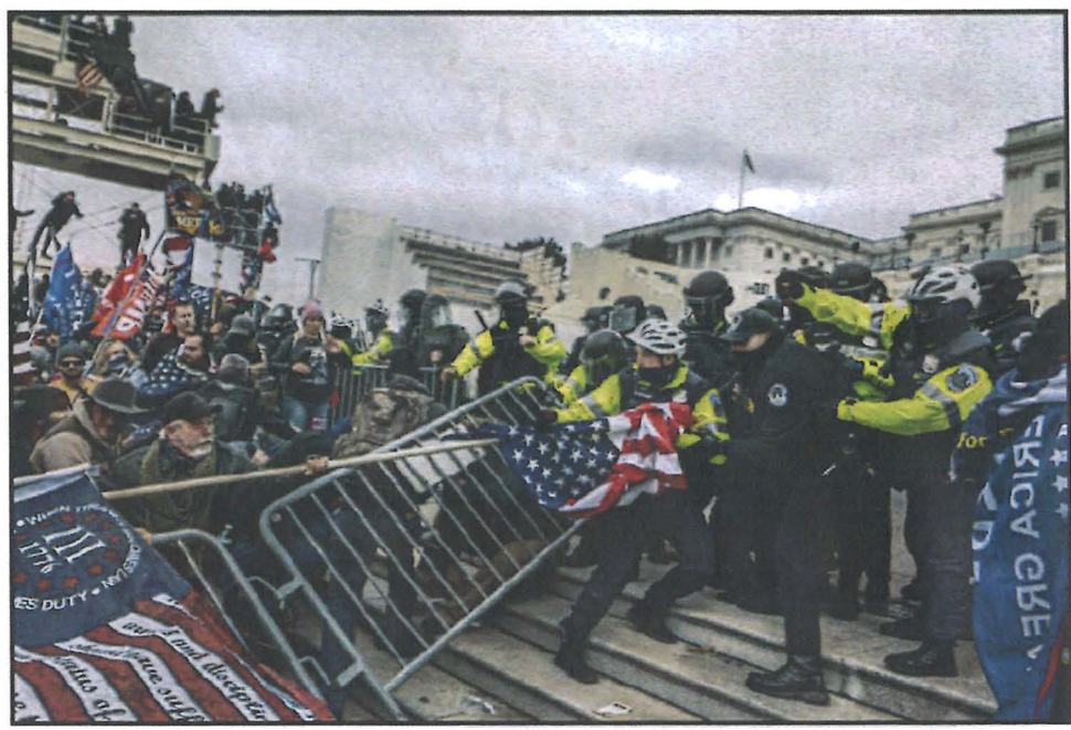
Photograph of the Capitol on January 6, 2021116