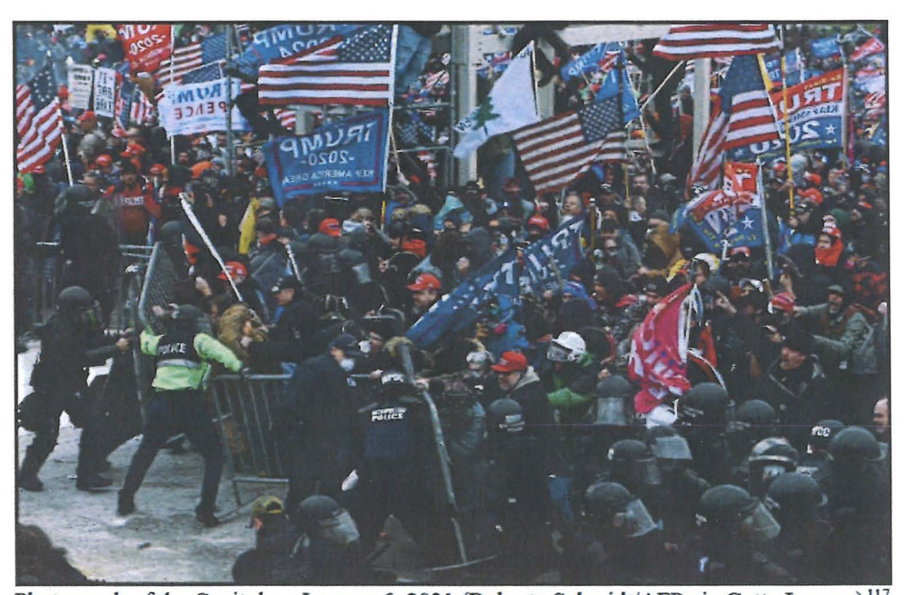
Photograph of the Capitol on January 6, 2021 117