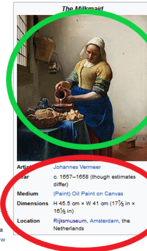
Arti : Johannes Vermeer Year : c. 1657–1658 (though estimates differ) Medium : (Paint) Oil Paint on Canvas Dimensions : H 45.5 cm × W 41 cm (17 7 ⁄ 8 in × 16 1 ⁄ 8 in) Location : Rijksmuseum, Amsterdam, the Netherlands

The leading artists in this tradition were the Antwerp painters Inachim Beuckelaer (c. 1535–1575) and Frans Snyder (1579–1657) who had many followers and imitators, as well as Pieter Aertsen (who like Beuckelaer had