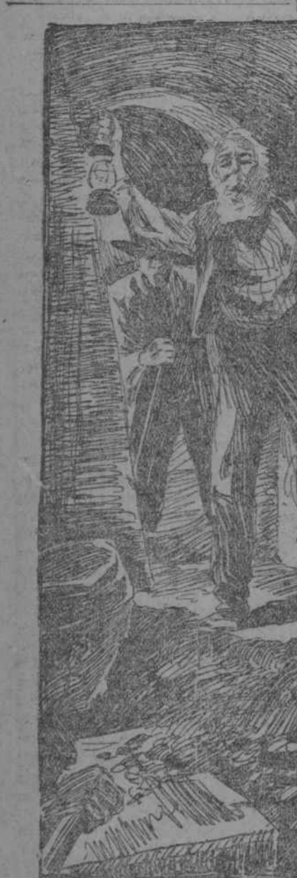
DISCOVERY OF THE BONES.

I locked the doors of the office, and my first intention was to dispose of the body to a Chicago medical college, from one of whose offices I had previously obtained dissecting material, as they believed, but in reality to be used in insurance work.