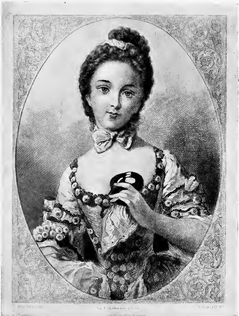
MARIE MADELEINE GUIMARD

From an engraving by GERVAIS after the painting by BOUCHER