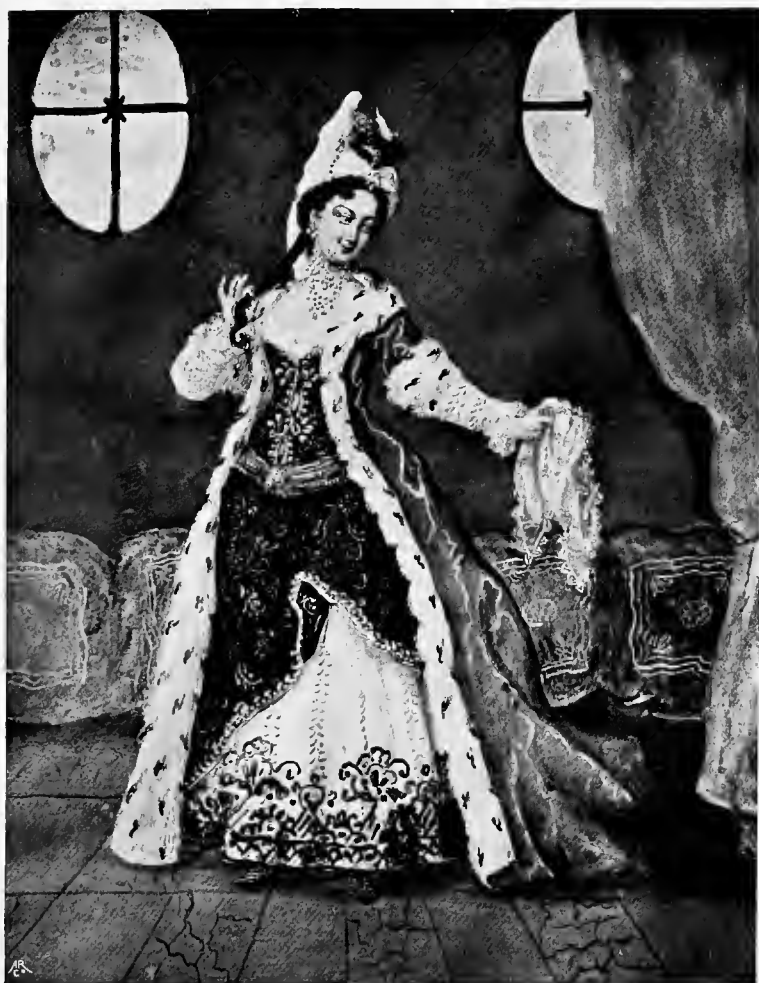
LOUISE CONTAT After the painting by DUTERTRE