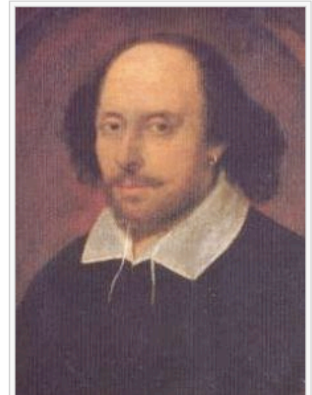
William Shakespeare ( National Portrait Gallery ), in the famous Chandos portrait , artist and authenticity unconfirmed.

Shakespeare's influence on the English-speaking world shows in the widespread use of quotations from Shakespearean plays , the titles of works based on Shakespearean phrases , and the many adaptations of his works.