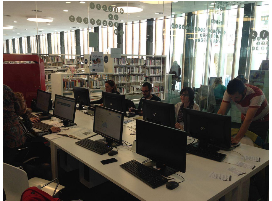
By Crispica (Own work) [CC BY-SA 4.0]

https://outreach.wikimedia.org/wiki/GLAM/Case_studies/Catalonia%27s_Network_of_Public_Libraries