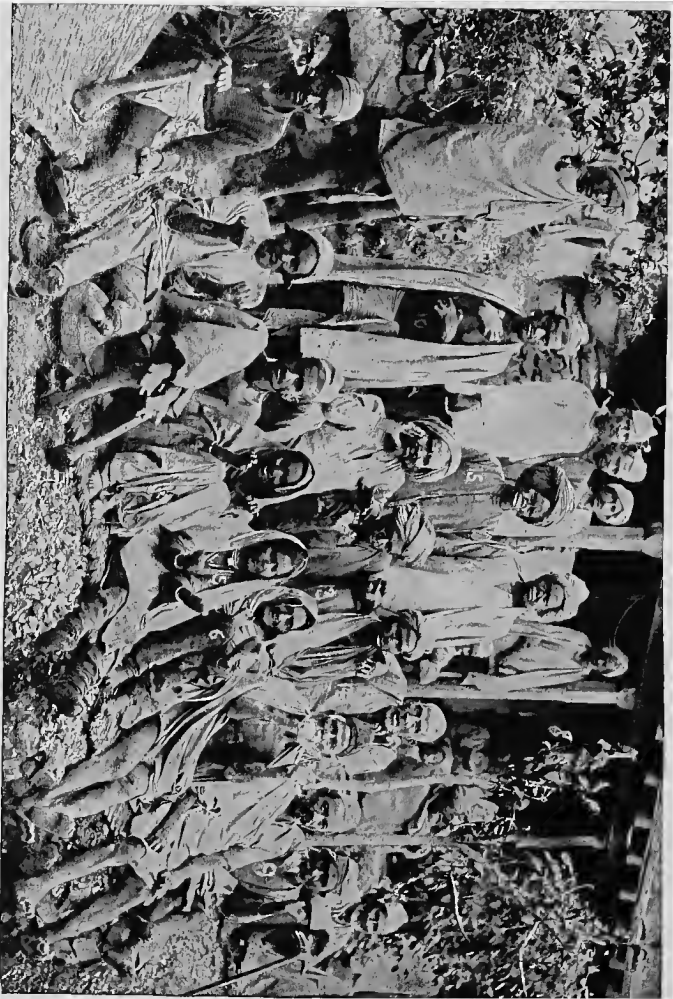
A GROUP OF INDIAN LEPERS AT SABATHU ASYLUM.