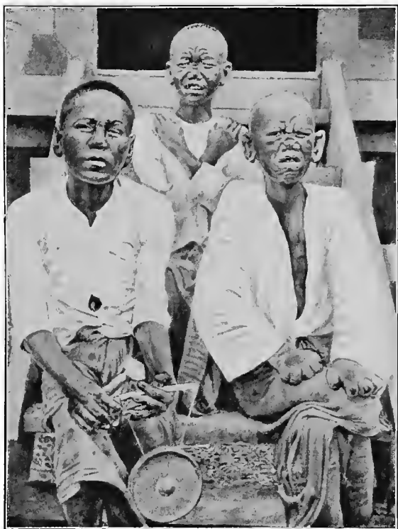
THREE BURMESE LEPERS.